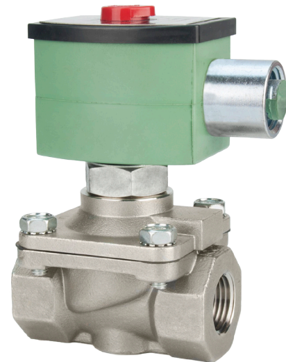
Model S2W Stainless Steel

Viton® is a registered trademark of DuPont Dow Elastomers.