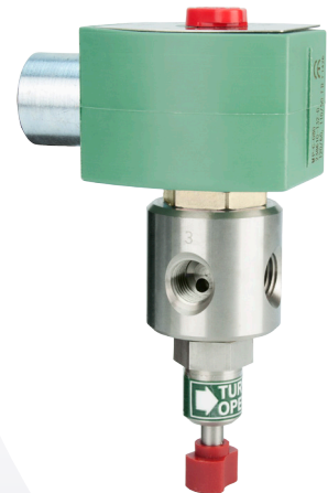
Model S3W Stainless Steel