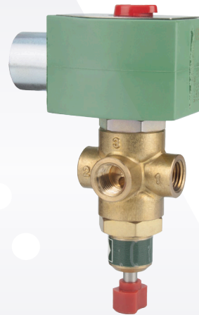
Model S3W Brass

Model S3W are pilot system 3-way solenoids. The solenoids can control valves independently or in combination with other control circuit pilots or accessories. Product is available with a wide range of options including: voltage (24 VDC or 120 VAC), operation (energize to open or closed) and a range of enclosures (general service to watertight to explosion proof).