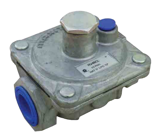
RV48CL-32_42 (1/2 PSIG Gas System)

Gas appliance regulators are designed for main burner and/or pilot applications, where precise control of tiny flows is an essential operating requirement. Housings are high strength aluminum castings and all models have been tested for multi-position and may be installed in any plane or angle without restriction. They may be used with natural, manufactured, mixed LP, or LP gas-air mixture.