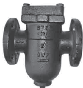
Models 165, 166-DI

165 Cast Iron Class 125 166-DI Ductile Iron Class 300