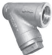
352½MM Sil-Braze ends