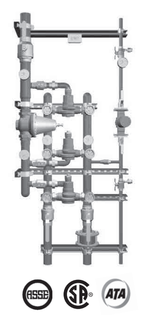
Advanced Thermal Activation