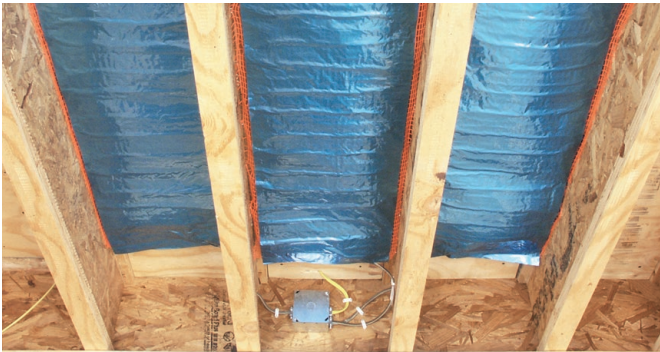
SunTouch UnderFloor - multiple joist bays