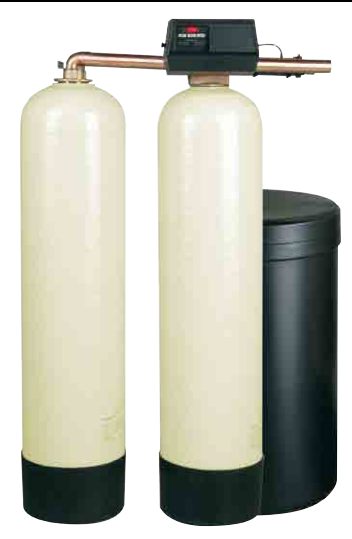
Series PWS15T Twin Alternating