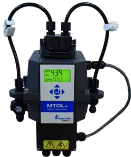
MTOL+ Online Process Turbidimeter Factory default 0 - 100 NTU