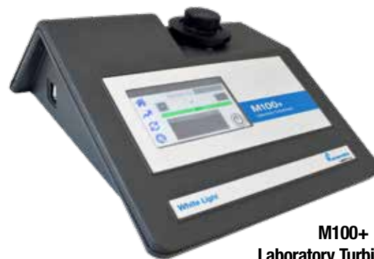
M100+ Laboratory Turbidimeter

*ProCal NTU Standards are EPA approved for use as primary NTU standards