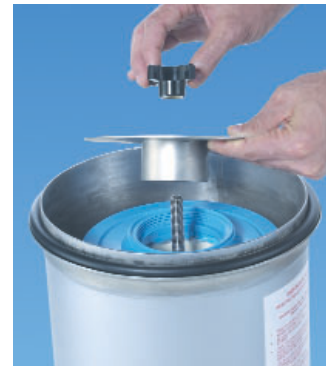
Adjustable compression cap Provides superior sealing at both cartridge ends.