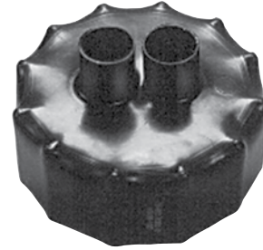
Insulated Barrier Heating PEX Water proof Shrink Cap.

The tail end of the pipe is now sealed water tight.