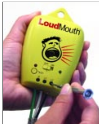
Connect the leads to the LoudMouth.