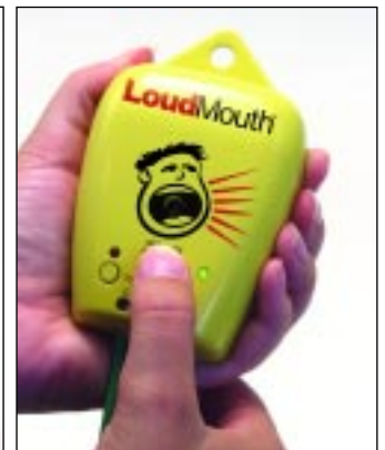
With the unit "ON". The green light should be lit.