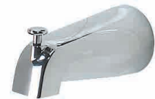
141 409 Shown

Showerheads are available in four models: deluxe chrome-plated brass, standard chrome-plated brass, adjustable massage, and economizer chrome-plated ABS. Arm and flange options include standard and deluxe chrome plated brass.