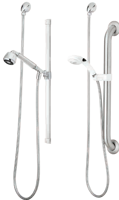
141 827 Shown