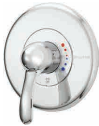
141 371 & 141 399 Shown

Deluxe chrome-plated brass faceplate and handle provide lasting performance and an attractive appearance.