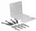
Brackets & Screws