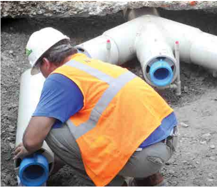
1.5" through 12" fusion