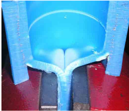
Superior System Integrity

Using Rionfuse RFCF electrofusion couplings, the RF-3000LE fuses with Orion polypropylene (PP, FRPP) and polyvinylidene fluoride (PVDF) piping systems in 1.5" through 12" connection sizes for single wall and double containment piping systems.