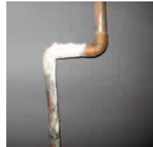
Hard scale build up on the exterior of copper pipe in a plumbing system.