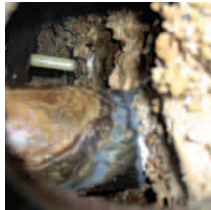
Large deposits of hard scale constrict water flow in this hotel plumbing system.