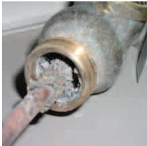
This temperature and pressure relief valve is clogged with hard scale.