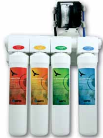
Kwik-Change RO with Permeate Pump.