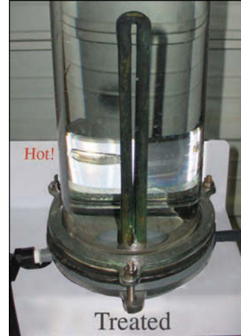
No Scale! (With ScaleNet treatment).