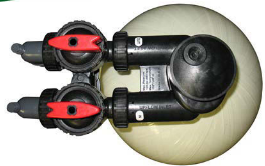
Top view with optional bypass