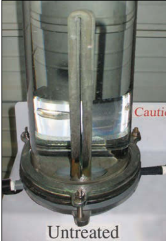
Scale Build-Up (In untreated water).