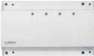
4-zone Slave Valve/Actuator