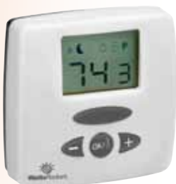
Battery-powered or 24v-powered