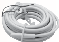
DualTemp Floor Sensor