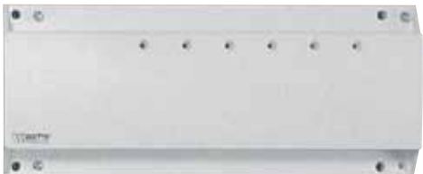
6-zone Slave Valve/Actuator

Each additional 40-VA 24-VAC transformer capacity can control an extra 12 actuators maximum; 18 actuators maximum with an additional 60-VA 24-VAC transformer. Actuators are switched by triacs, for safe, quiet, reliable electronic operation. Mounting is by DIN rail or surface mount to a wall.