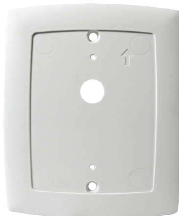
Adaptor Plate 012

The Adaptor Plate 012 covers the paint ring left behind when replacing other thermostats, so that no patching or painting the wall is required. The adaptor plate also allows a thermostat to be installed onto a single gang electrical box. The adaptor plate package includes screws for mounting the adaptor plate and the device that attaches to it.