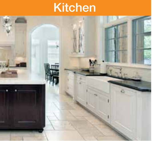
Typical usage cost: $6-$7 per month