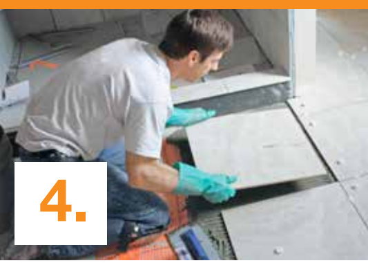
*After you complete Step 4, wait 28 days for the mortar to cure completely before having a certified electrician connect a SunStat thermostat.