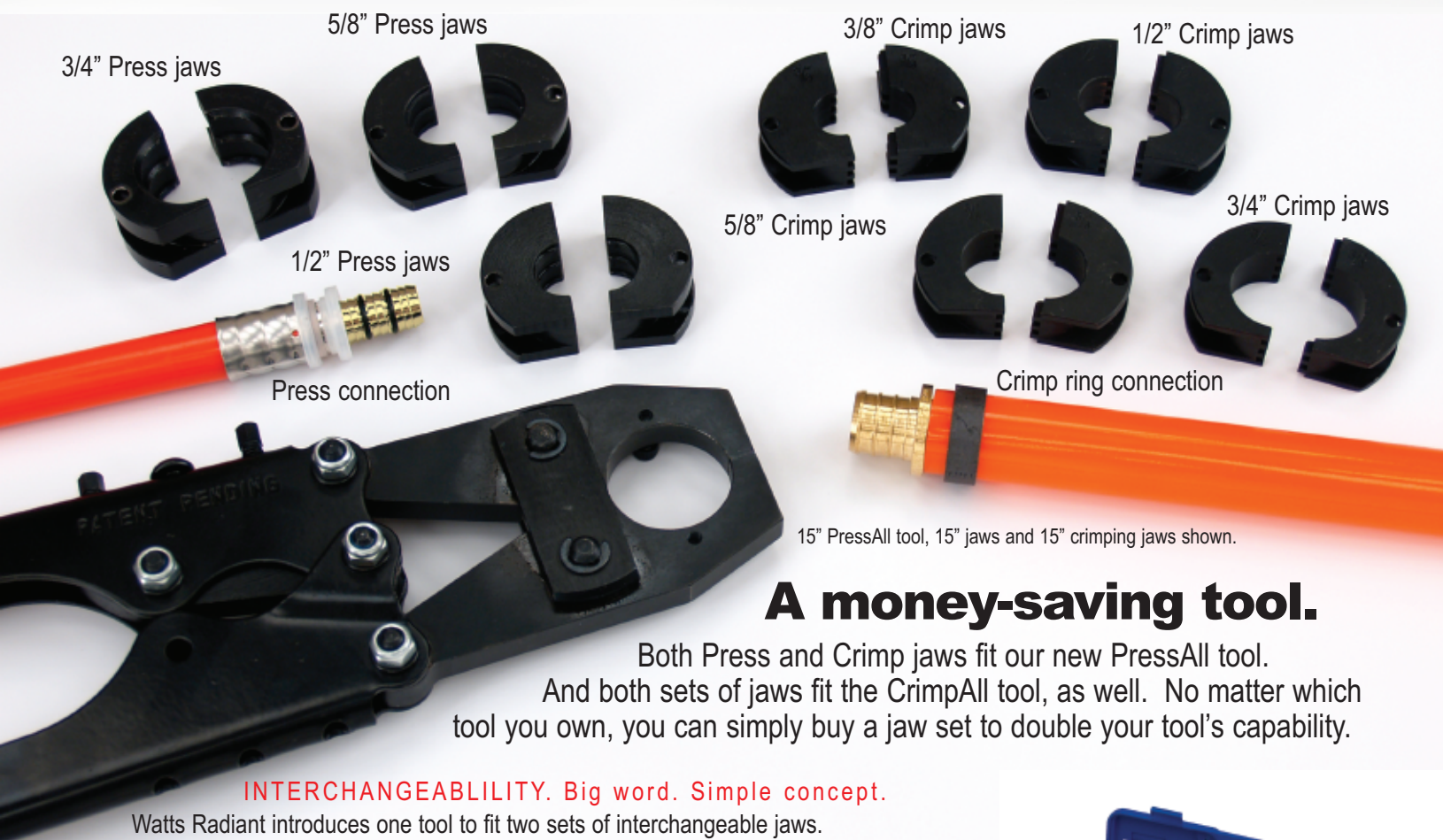
15" PressAll tool, 15" jaws and 15" crimping jaws shown.